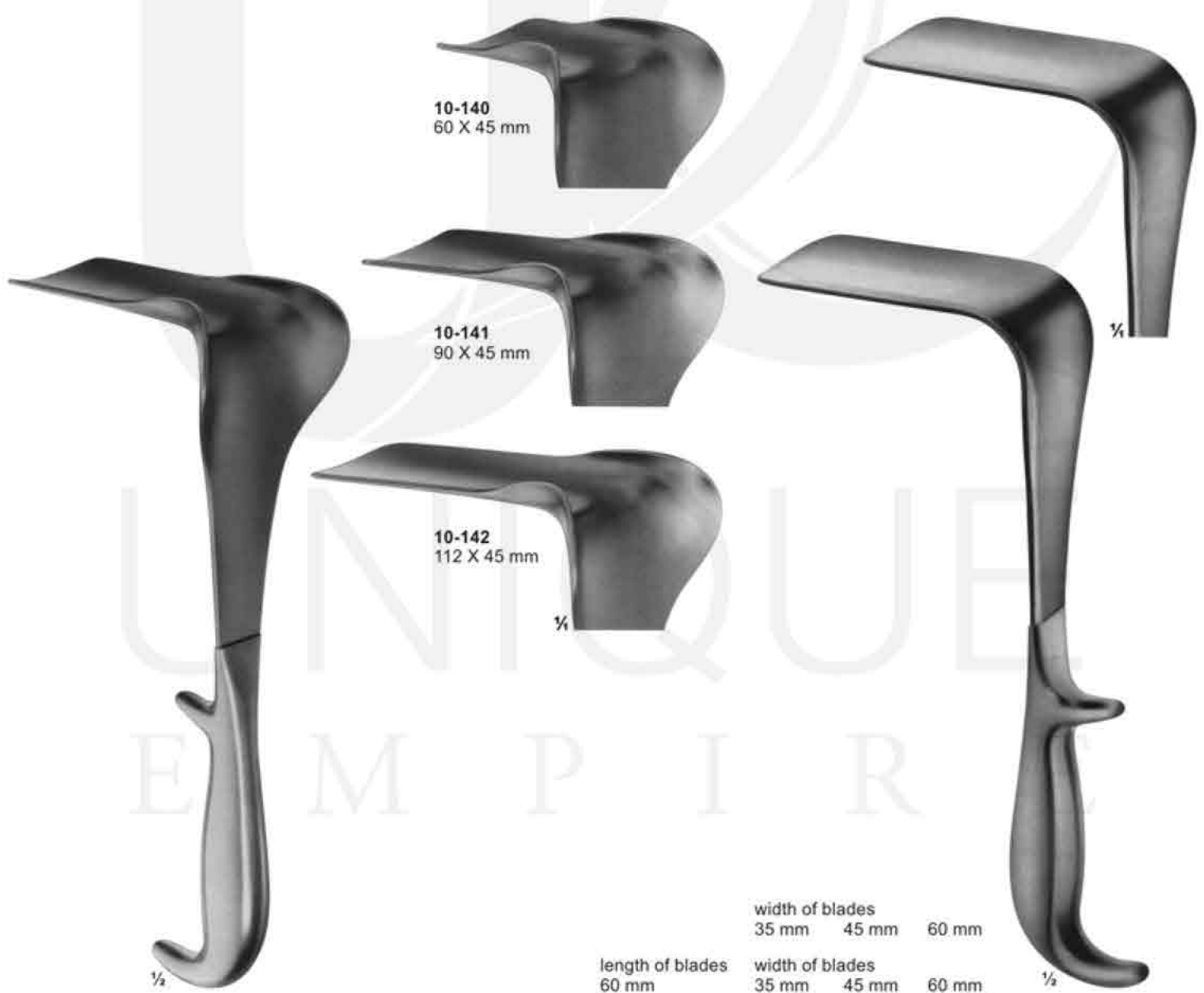
10-140 - 143 DOYEN 235 mm