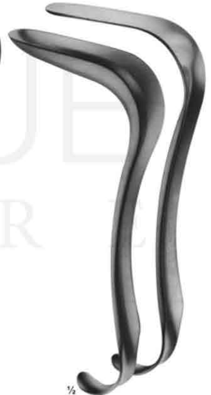
10-124 - 10-126 KRISTELLER 10-124 70X27 mm 10-125 75X30 mm 10-126 90X36 mm 175 mm