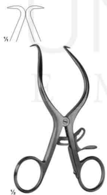
1/2 10-156 GELPI 135 mm