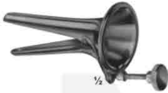
10-101 COLLIN for children 53 x 10 mm