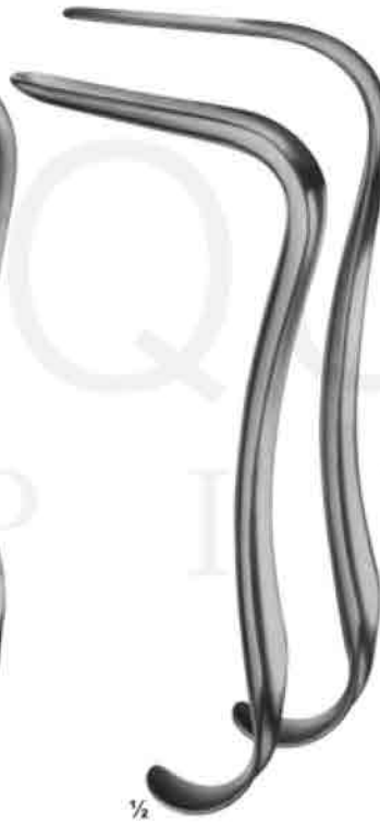
10-123 KRISTELLER 70X15 mm, ( 170 mm ) For children