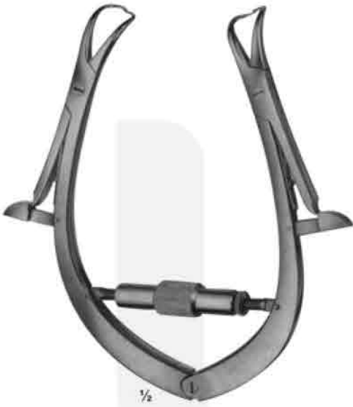
1/2 10-154 JOLL (FRIEDMAN) 155 mm