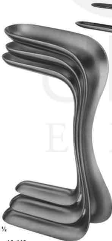
10-119 SIMS 70 X 26 mm / 75 X 30 mm 75 X 30 mm / 80 X 35 mm 80 X 36 mm / 90 X 40 mm 175 mm