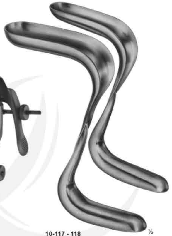
10-117 - 118 BRIESKY 10-117 72X25 mm / 77X30 mm 140 mm 10-118 75X30 mm / 92X38 mm 170 mm