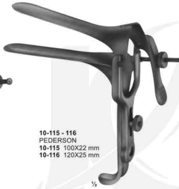
10-115 - 116 PEDERSON 10-115 100X22 mm 10-116 120X25 mm