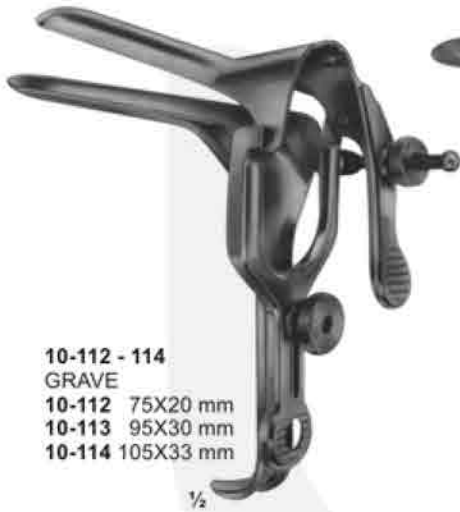
10-112 - 114 GRAVE 10-112 75X20 mm 10-113 95X30 mm 10-114 105X33 mm