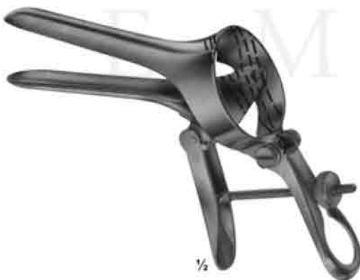
10-108 CUSCO for virgins 75 x 17 mm