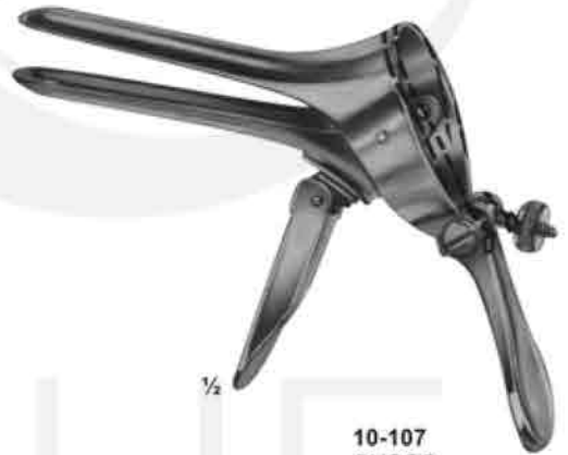
10-107 CUSCO for virgins 75 x 17 mm