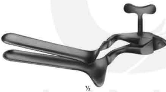
10-106 COLLIN for virgins 95/85 x 18 mm