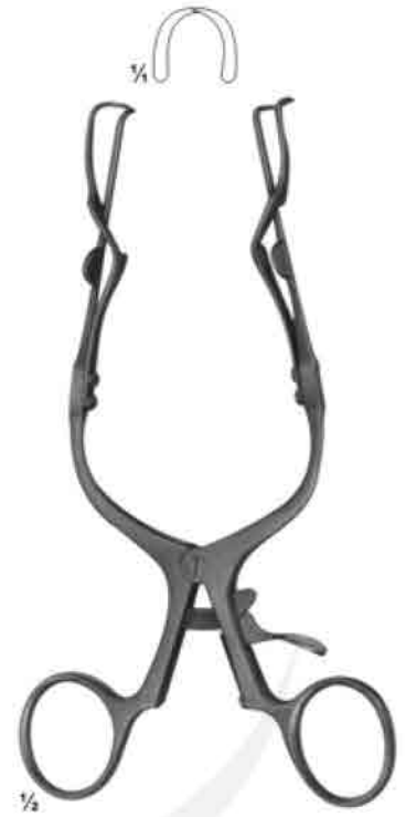
1/2 10-155 RICHTER 170 mm