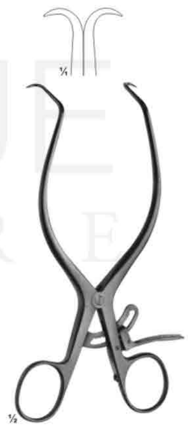
1/2 10-157 GELPI 175 mm