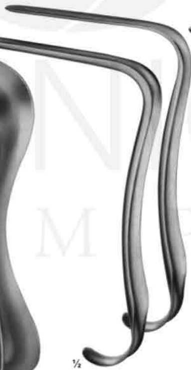
10-120 - 122 SEIDL 10-120 80X8 mm 10-121 80X10 mm 10-122 90X14 mm For children and infants 170 mm